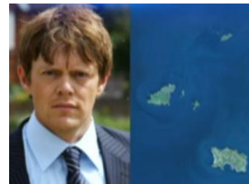
6. Marshall Islands