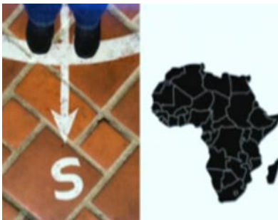
4. South Africa